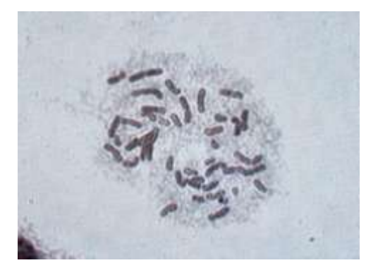
Figure 1 A chromosome spread on Aclar film attached to a glass slide after flat-embedding in epoxy resin.